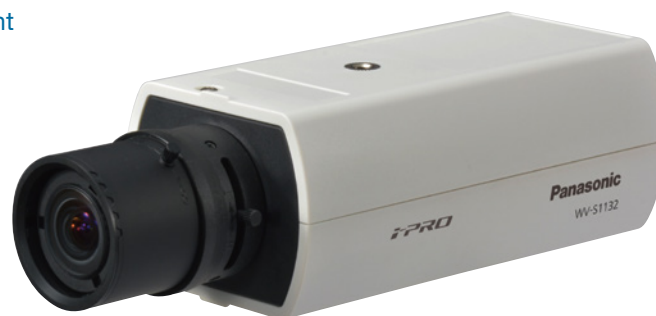
Lens not included