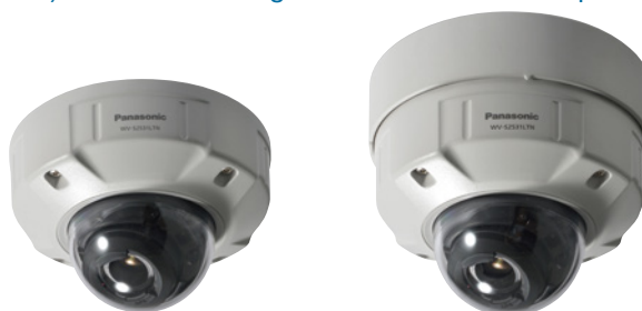
with Base Bracket