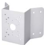
PFA151 Corner mount